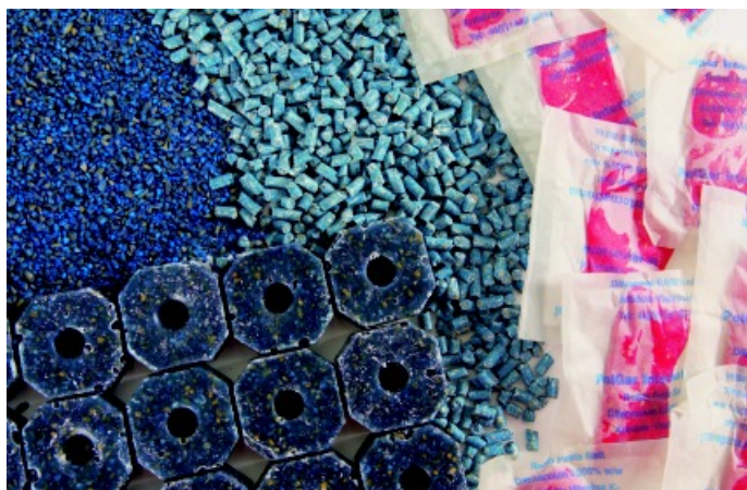
Formulation choice is key to any rodent control campaign

Bromadiolone is regarded by some manufacturers as a 'single-feed'