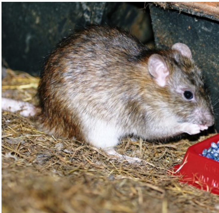
Table 2: Non-target toxicity – LD 50 grams of bait per kilo of animal

Understanding and choosing the right active substance for the job in hand is vitally important due to the significant variation in activity they have against rats and mice and the toxicity to non-target animals. The choice of active substance should form part of the general risk assessment, considering where the key activity is on a site and looking at the potential exposure to both humans and non-target animals. Formulation choice is also key in any rodent control campaign as the rodents must first find the bait and consume a lethal dose. No rodenticide, or formulation, is completely universal and selecting the correct product for a job will save both time and money and minimise environmental risk.